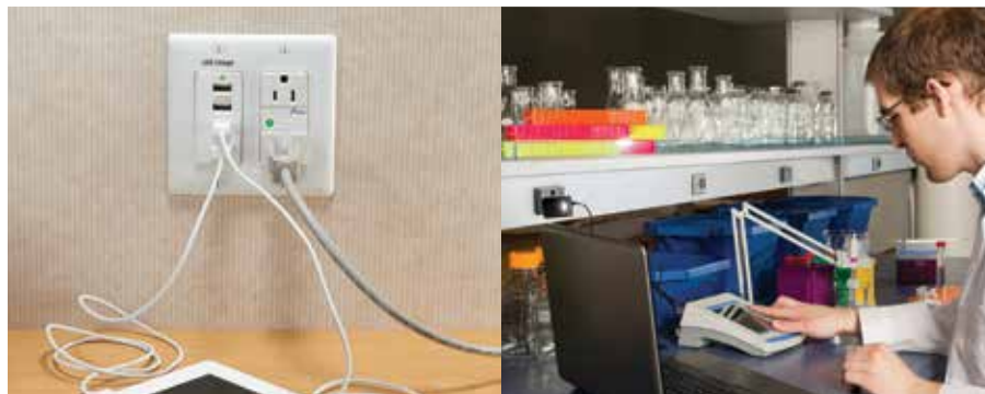
Raceway USB power strips are the perfect charging solution for lab and workbench applications.

Ideal for new construction for offices. Pair the 4 port USB with surge suppression outlets for more charging ports and power.