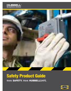
Safety Product Guide