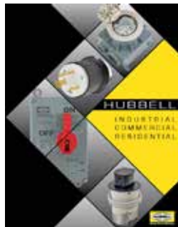
Hubbell Wiring Device-Kellems Full Line Catalog

Hubbell offers an extensive literature library for product support. Downloadable PDFs are available online.