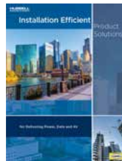
Installation Efficient Product Solutions