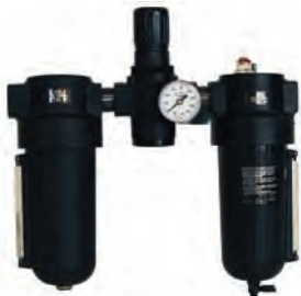
with metal bowls