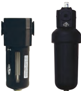
7 oz. reservoir