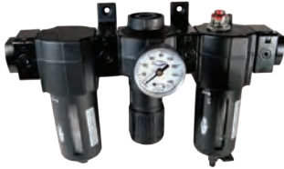
transparent bowl with guard