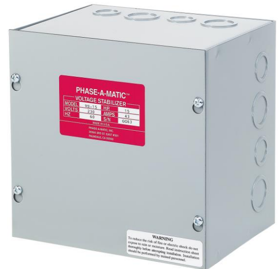
Model VS-15 Shown