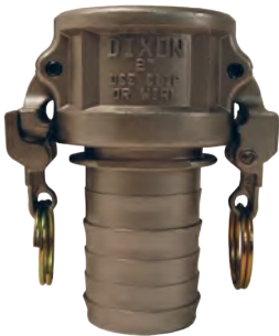
female coupler x notched hose shank