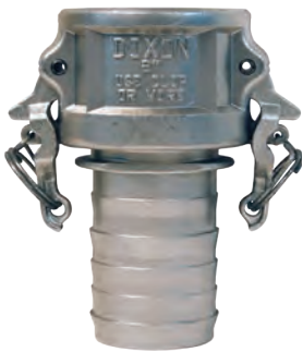
female coupler x notched hose shank