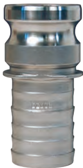
male adapter x notched hose shank