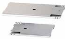
Splice Trays STRAY24F STRAY12F