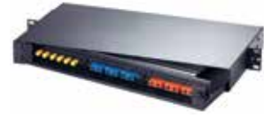
Pre-Punched, FSP, Loaded FPR3SP