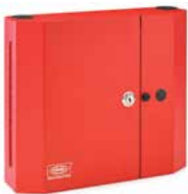
Double Door, NAFTA FCW4SPRDGSA