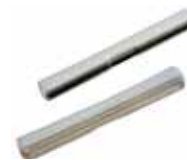
Fusion Splice Protection Sleeves FSHST401025 FRSHST401025