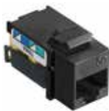
Snap Fit Jack NSJ5EBK

xx = Color: BK (Black), B (Blue), GY (Gray), GN (Green), I (Ivory), LA (Light Almond), OR (Orange), R (Red), W (White) and Y (Yellow) *Available in BK, B, LA, OR and W only.