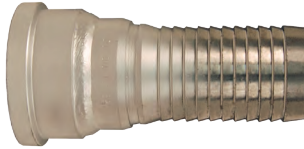
heavy duty raised end