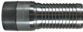
male pipe threaded end