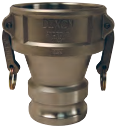
3" coupler x 1½" adapter