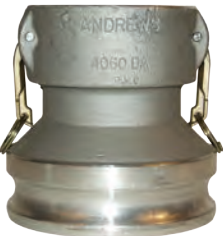
4" coupler x 6" adapter