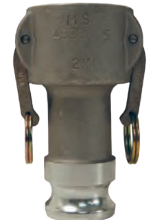
3" coupler x 2½" adapter