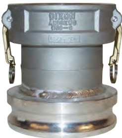
5" coupler x 6" adapter

In reducing cam and groove couplings, the coupler is the first size in the part number; (i.e., a 4030-DA-AL is a 4" coupler to a 3" adapter).