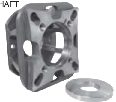
Screw Conveyor Adapter Kit

(3) Felt seal can be only added to the waste pack seal cartridge only.