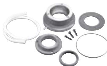
Packing Gland Kit