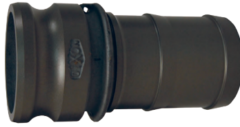
aluminum hard coat