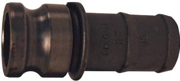
unplated malleable iron