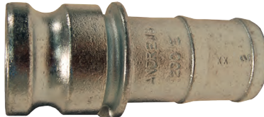
plated malleable iron